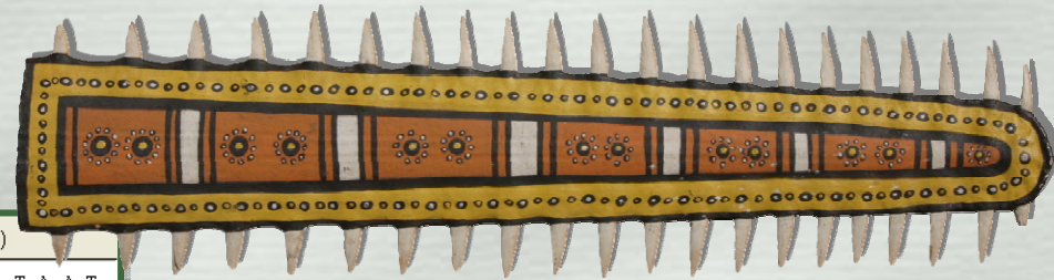
P. microdon rostrum.

Agarose gel of DNA and mtDNA sequence data.