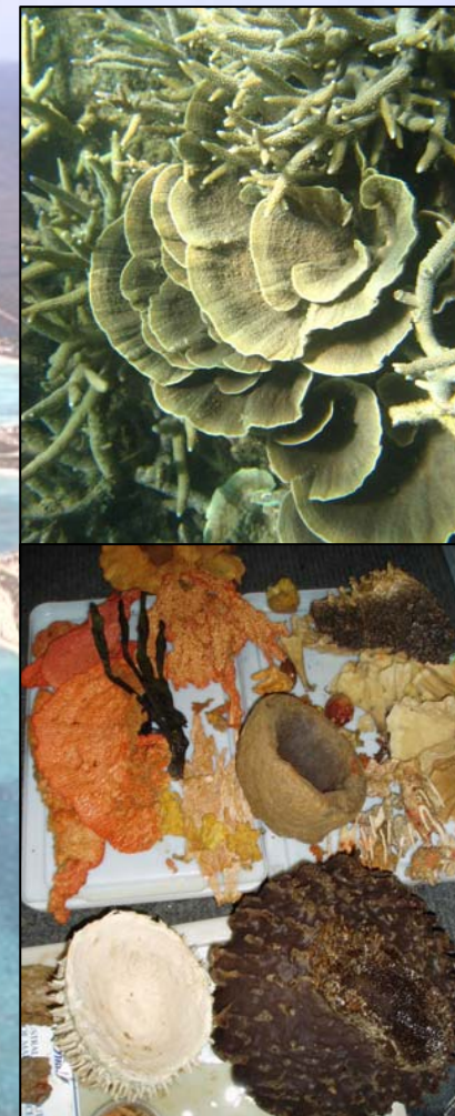
Habitats and communities