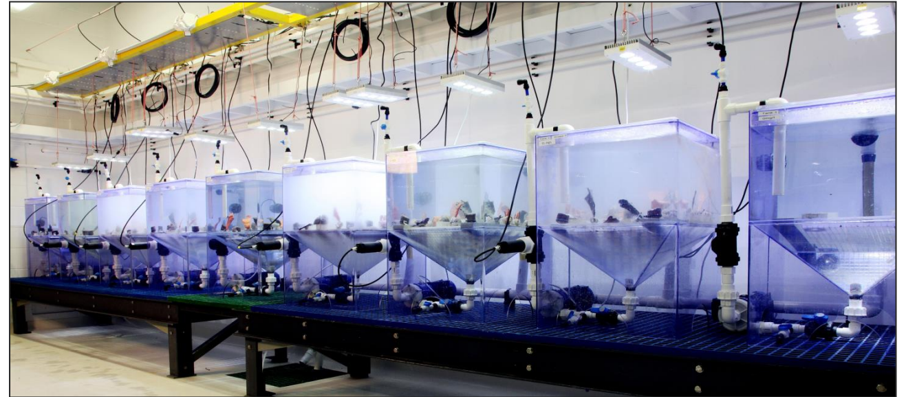
Australian Institute of Marine Science (AIMS, Townsville Queensland).